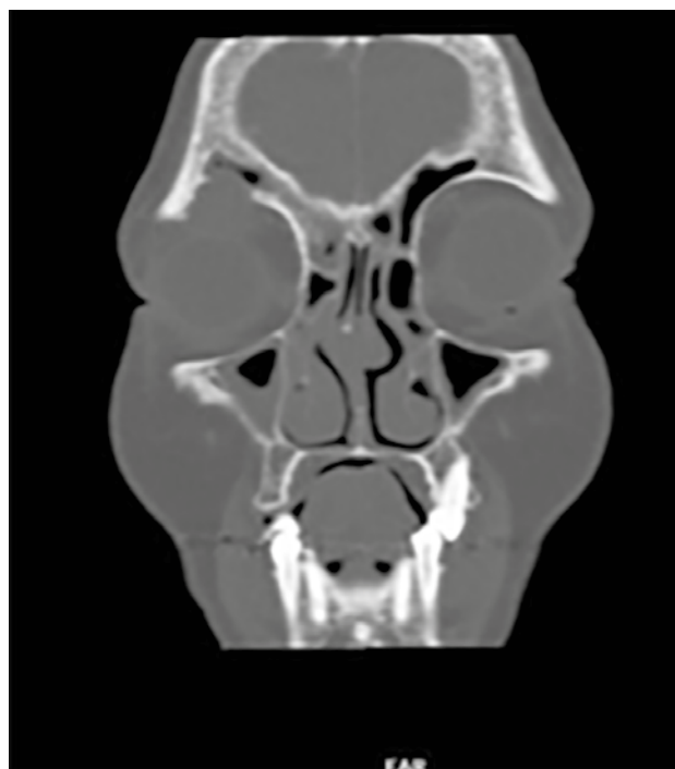
Figure 2b: Coronal CT image showing lesion in right orbit with frontal sinusitis and erosion of its inferior wall

Diagnostic Nasal Endoscopy (DNE) showed mucoid discharge in nasal cavity. Routine blood investigations were normal. Surgical excision of the swelling with reconstruction of floor of frontal sinus with cartilage allograft was planned. A curvilinear incision was made along the lower margin of right eyebrow. The muscles were divided and orbital fat