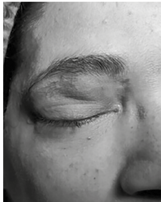
Figure 1: Showing the right supraorbital mass

Orbital involvement is usually secondary in cases of fungal granuloma. However, patients can present initially to the ophthalmologist with ocular complaints. We herein report a case of right sided sino-orbital fungal granuloma in a healthy adult.