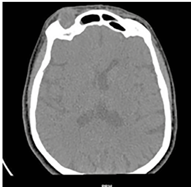
Figure 2a: Axial CT image showing soft tissue lesion involving extraconal space of right orbit

Differential diagnoses of orbital dermoid cyst and frontal sinus mucocele were initially made as the patient had no significant sino-nasal complaints. However, she was then referred to the ENT department for further management. USG-guided FNAC was done under strict aseptic precaution and it revealed occasional cyst macrophages in a proteinaceous background without any malignant cells.