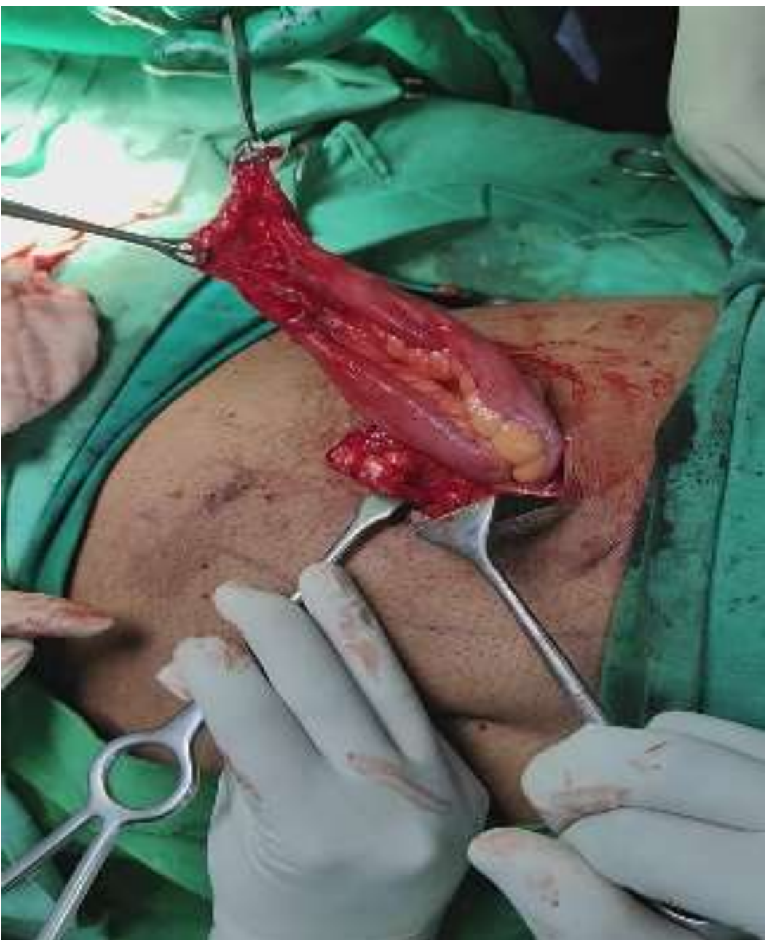
Intraoperative picture of hernial sac